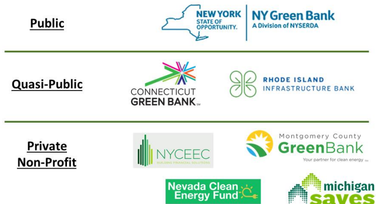
Figure 4. Example US Green Banks by Structure

Green Banks at the state and local level have taken a variety of structures including public, quasi-public and nonprofit models. Figure 4 provides examples of currently operational Green Banks in the US across these models.